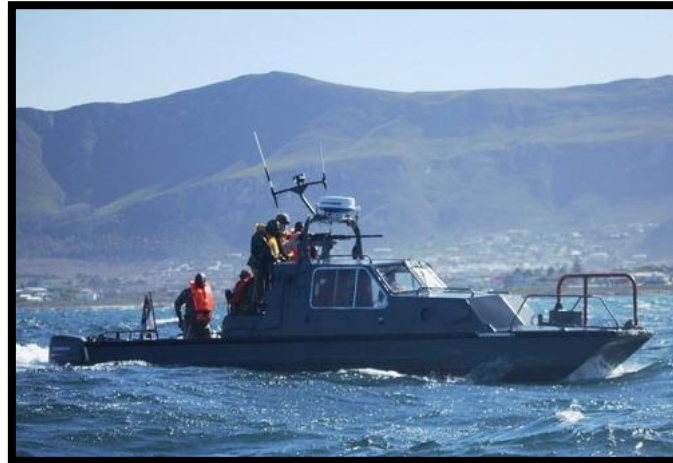
An SA Navy Namacurra on patrol in the Overberg.

The South African National Defence Force (SANDF) maintains its Operation Corona border safeguarding deployment in the Western Cape is successfully deterring illegal fishing activities.