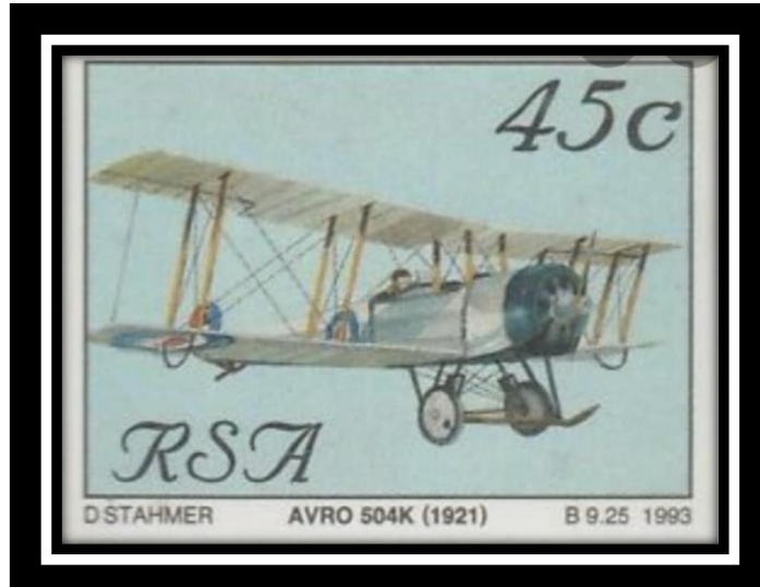
Gedenkseël: Avro 504K (1921)